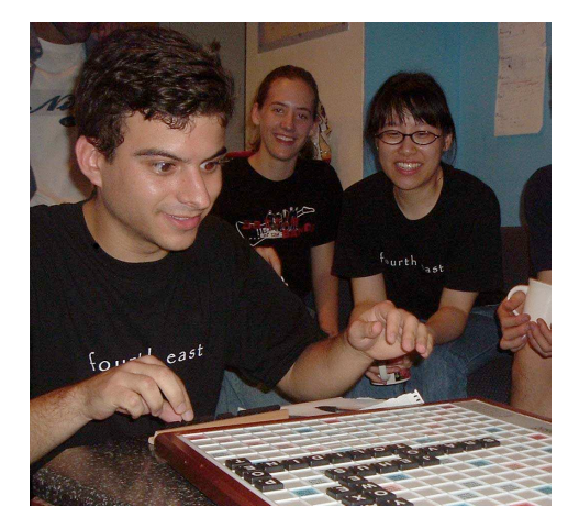
A friendly game of scabble over cocoa with our GRT.

A Chocobo-shaped cake? Where else would you find one but Fourth East? Tired of tooling? Have a birthday? Thirsty? Bored? Tired of punting? Then come one and all to the infamous nightly cocoa, held every school night. As upperclassmen and freshmen alike anticipate the start of term, excitement builds at the prospect of a new year of cocoa calls and delicious baked goods. Kitchen culture is strong here and we love to prove it with awesome cakes for your birthday. Some highlights of the past year include a nonstop week of birthdays, Boston cream cupcakes, neon-colored frostings, and the aforementioned chocobo. What will the next year have in store? Perhaps some fancy new dessert for our biannual formal cocoa? Two new cocoa chairs will lead us into the next term, summoning us from our rooms to come drink cocoa (or tea) and be merry, keeping alive a tradition that dates back several decades. Great job to the cocoa chairs of years past, for keeping slug lore and history alive!