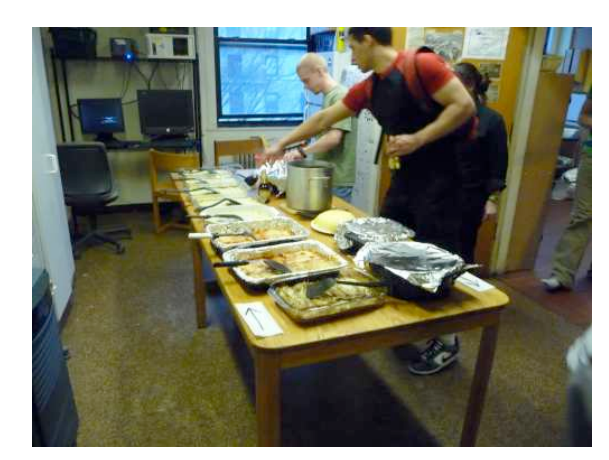
Many delicious foods were available.