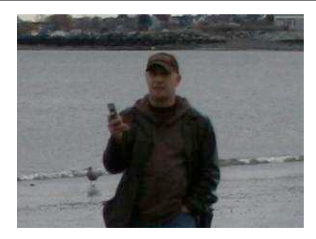
Watch out for creepy dudes!

There were several Gaybraham Lincoln sitings around the Boston area this weekend. Reports are that three Gaybrahams were seen fishing for freshmen in Killian court. Others say that they saw Lincolns pole dancing on the subway and chasing pigeons on the beach, the Weekly Awesome cannot confirm or deny any of these rumors. All we can say is be on the look out for Lincolns acting out and for creepy old dudes like the one shown here.