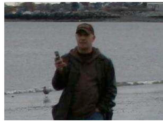
Watch out for creepy dudes!

There were several Gaybraham Lincoln sitings around the Boston area this weekend. Reports are that three Gaybrahams were seen fishing for freshmen in Killian court. Others say that they saw Lincolns pole dancing on the subway and chasing pigeons on the beach, the Weekly Awesome cannot confirm or deny any of these rumors. All we can say is be on the look out for Lincolns acting out and for creepy old dudes like the one shown here.